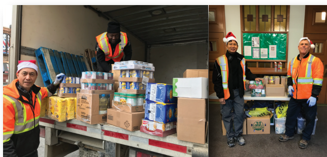
Fer-Pal Construction surprised us with a Christmas delivery of several pallets of much needed food items.

One of our youngest community members surprised us by collecting and then donating gift cards she received for her birthday. These helped add a little bit of cheer to many people's holidays.