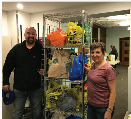
Delivery of the Red Label Hair Company Holiday Food Drive