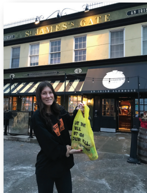
St James' Gate Irish Pub in Etobicoke, Holiday Food Drive.