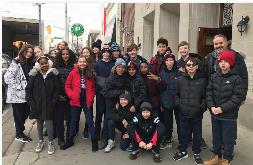
Staff and Students from St. Pius X Catholic School held a holiday food drive. They then delivered and helped to sort the donations for us.