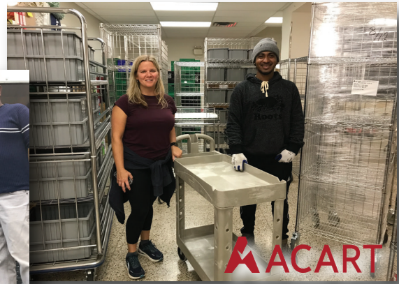
Acart delivering and setting up all of our new shelving!