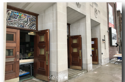
Saint Pius X Catholic Church on Bloor St. W.